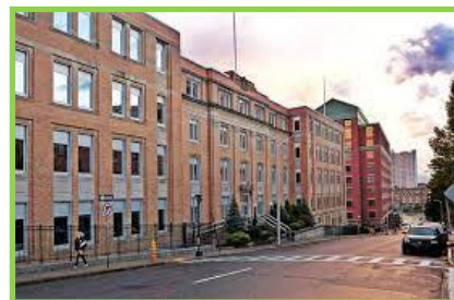
CLW's new office.

18 Chestnut Street, Suite 540 Worcester, MA 01608