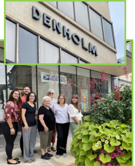
DHILS Staff in front of the Denholm Building