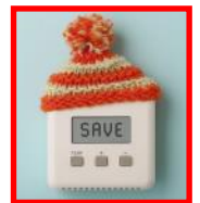
FY23 LIHEAP Income Eligibility