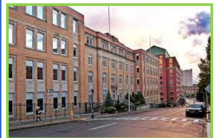
CLW's new office: 18 Chestnut St., 5th Floor